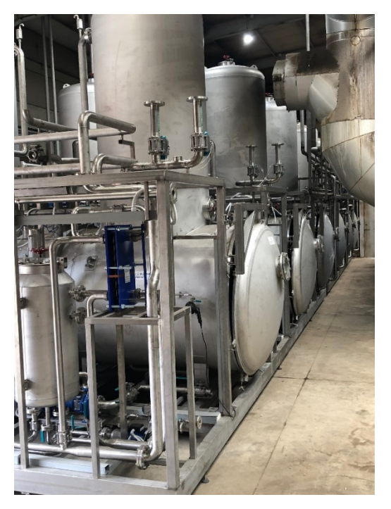
Photo of the Evaporator-condensator installation at AmPower (Pittem, Belgium).