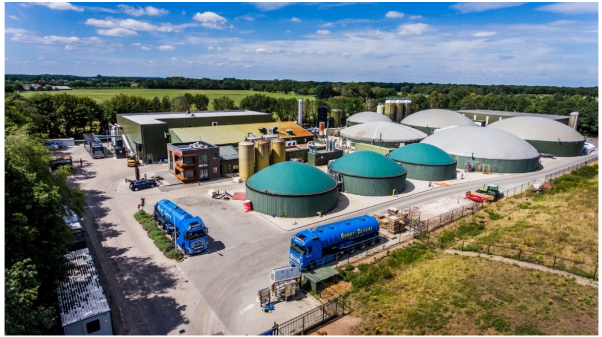
Photo of one of the demonstration plants: Groot Zevert Vergisting (Beltrum, The Netherlands)